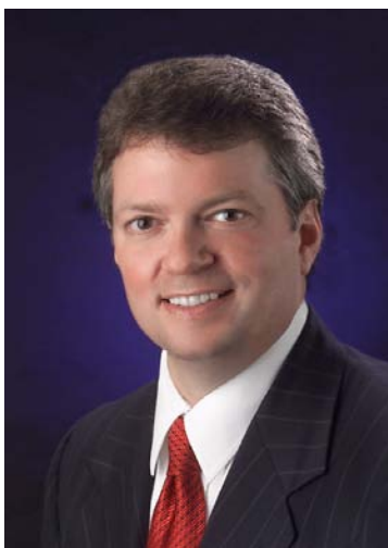
JIM HOOD ATTORNEY GENERAL